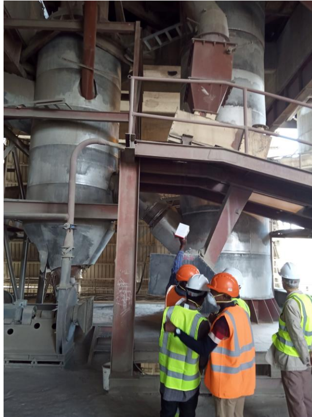
Visit at a cement plant