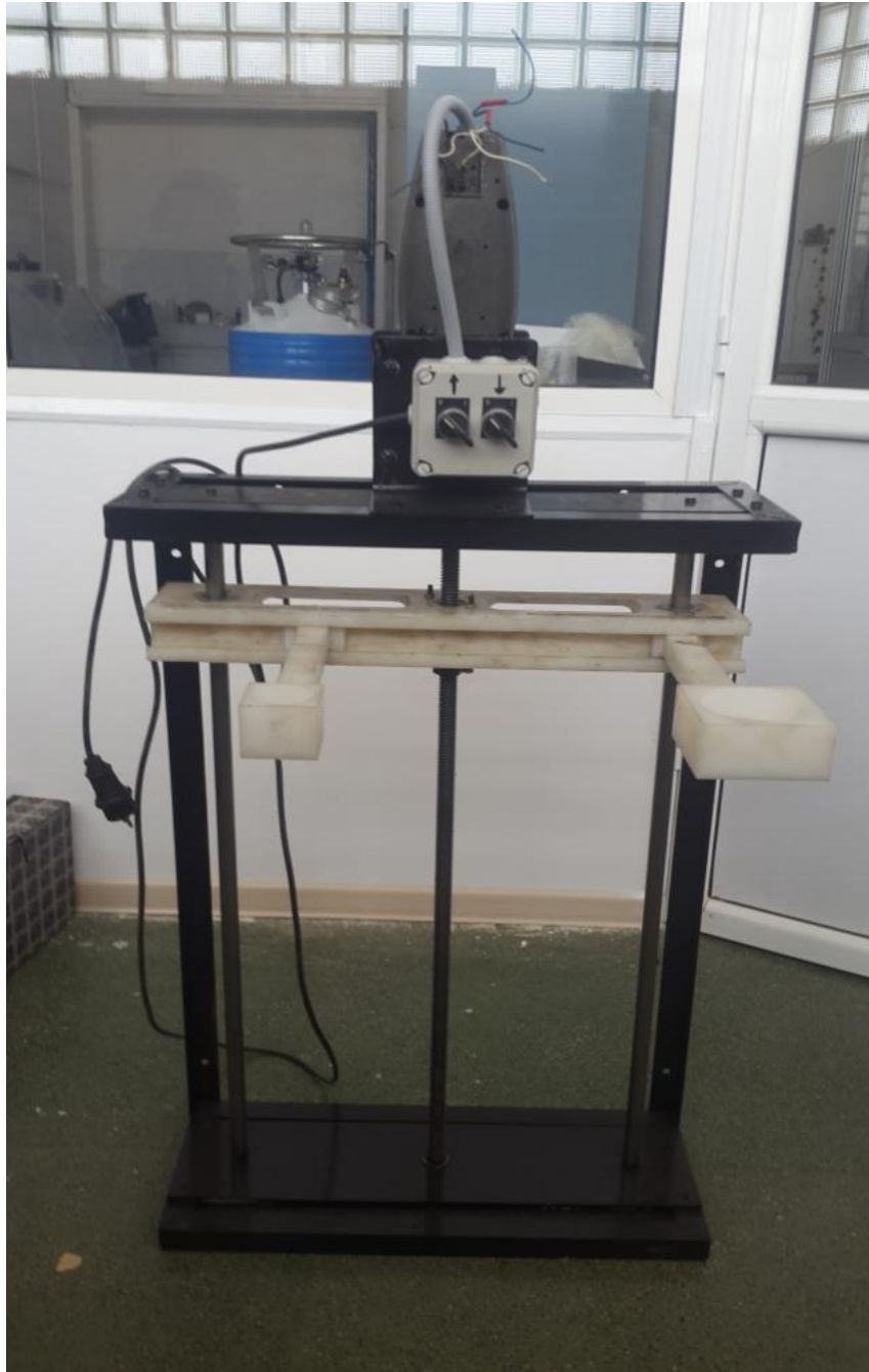
Figure 1 Gamma ray scanning device