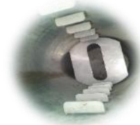
Figure 3: View inside the 50 cm diameter vessel

Figure 3 shows the interior of the vessel with 50 cm diameter. The two rows of angle plates at the inner side of the vessel are able to support any internals like intact or damaged trays, sieves, perforated plates and so on.